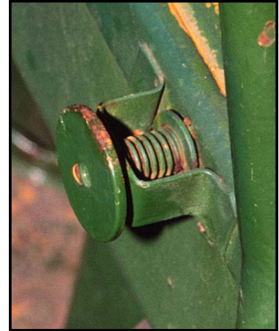
Photo 3 -- Close-up of spring-loaded pin on left side

The adjustable top part of the seat frame moves forward and backward on the tracks/grooves. Bent metal tabs at the end of the tracks are designed to keep the seat in the adjustable range. The back and armrests are welded directly onto the sliding top part of the frame (see Photo 4). Over time this seat attachment may become loose, especially if the spring-loaded pin is not keeping the seat in place. The tabs may wear, and the top frame may bend or wear and be more prone for sliding out of the tracks.