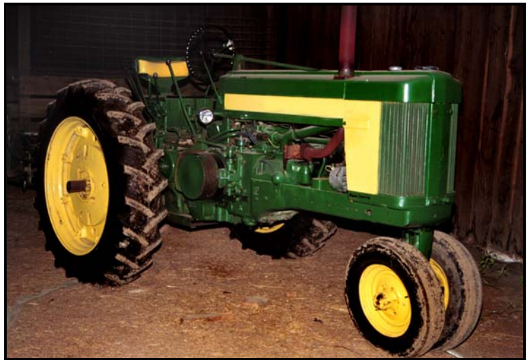
Photo 1 -- Side view of identical tractor model.

A 56-year-old grain farmer was killed when the seat of his tractor fell off while driving through a washout area in a cornfield. The man was driving a 1950's model two-cylinder tricycle-type tractor, pulling a rear-mounted rotary mower. His other tractor was in the shop, so he was using this older tractor. He had recently rented the field and was working it the first time, mowing corn stalks and preparing the field for spring planting. While mowing, he drove