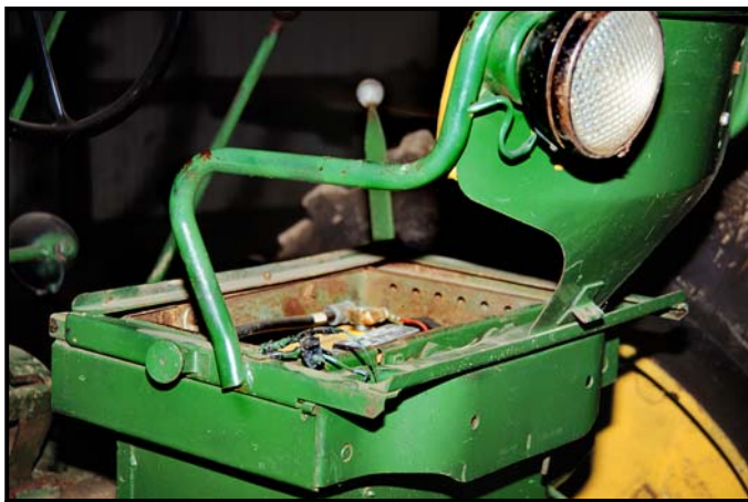
Photo 4 -- View of left side of seat, showing sliding track and armrests welded to the seat edge.

The tile washout or blowout had occurred in the field and the farmer had no knowledge of it. A field tile was draining the terraced section of the field above it, and was buried 0.9-1.2 meters (3-4 ft) underground. This tile apparently had a hole in it, and the resulting surge of water through the hole washed away the soil above it, leaving a conical depression in the field. There was no obvious ditch created from flowing water, but just a sinkhole on top of the leaking tile. This sinkhole created a dangerous condition, as it was not easily recognizable in the middle of the