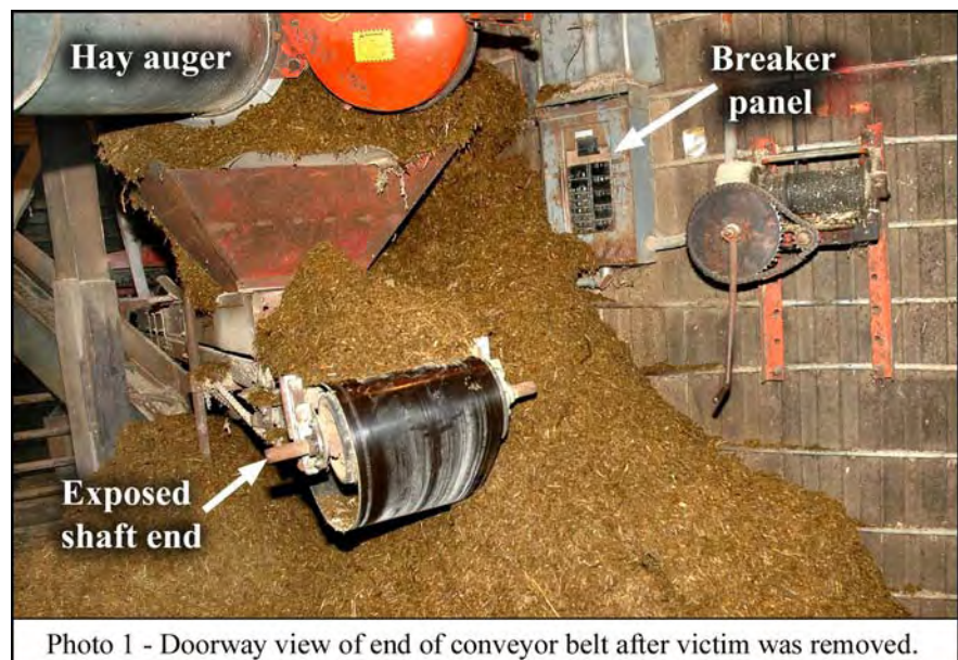
Photo 1 - Doorway view of end of conveyor belt after victim was removed.

During the fall of 2004, a 45-year-old Iowa farmer was killed when he became entangled in the exposed shaft of a silage conveyor pulley. He was mixing and feeding silage to his herd of heifers. Hay silage from an oxygen-limiting silo was mixed with corn silage from another silo, and the conveyor belt carried the mixture to a feed bunk 60 feet (27 m) long. The mixing took place in a shed between the two silos, which were approximately 10 feet (3 m) apart. Controls for the silo unloaders were mounted on the walls of each silo. The hay silo had a control switch box, while the corn silo was