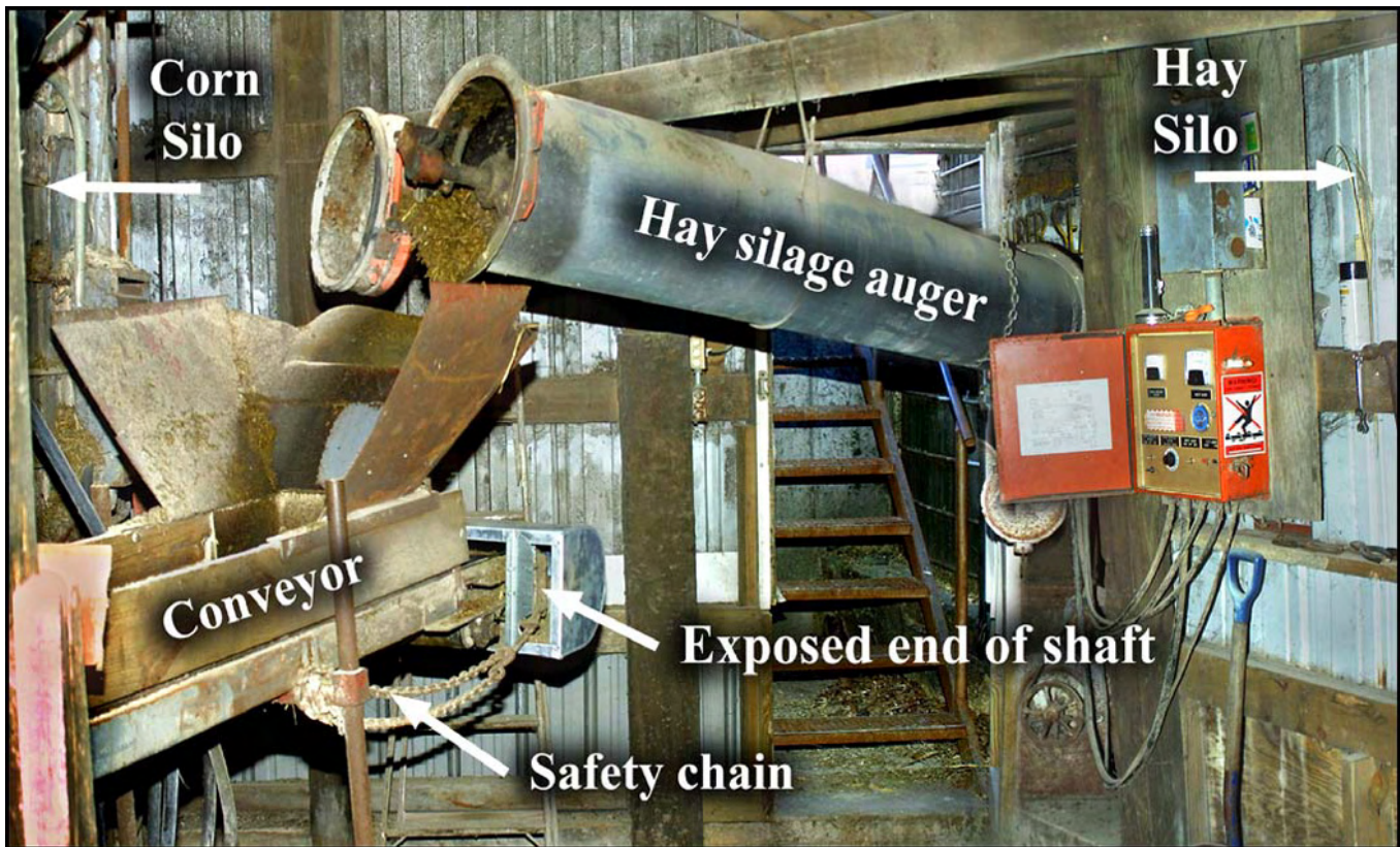
Photo 3 - Composite photograph from the west end of the shed showing both silos, the end of the conveyor belt (now with guard), and the control panel for the hay silo.

mixed in the shed between the silos and carried to the animals along the conveyor belt. An adjustable moving sled dropped the silage from the belt to alternating sides of the feed bunk. The feed conveyor was purchased and installed new in the late 1970s.