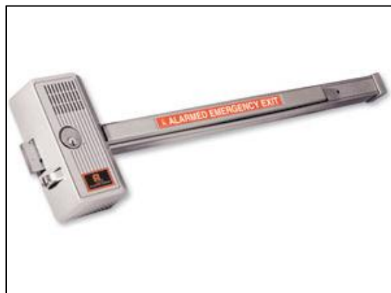
Exhibit 2: Example of a panic bar ("crash bar") similar to the bar mounted on northwest delivery door

The first local firefighters arrived on site six minutes after the 911 call. Four fire trucks were on site within 10 minutes of the call and began interior and exterior attacks to extinguish the fire. Search operations included forcible entry through the northwest emergency exit. Firefighters used pry bars and a K12 saw to cut the delivery door open because it had no exterior opening mechanism. Firefighters found the employee at approximately 4:14 am. She was in room B near the door jamb between rooms A and B, and close to the delivery door. At this time, she was unresponsive. Firefighters cleared materials from the storage room, throwing them out the door, to make way to move the employee outside and onto a gurney. Life-saving efforts were begun by on-site EMTs, and she was transported to the local hospital, where she was pronounced dead at 5:18 am.