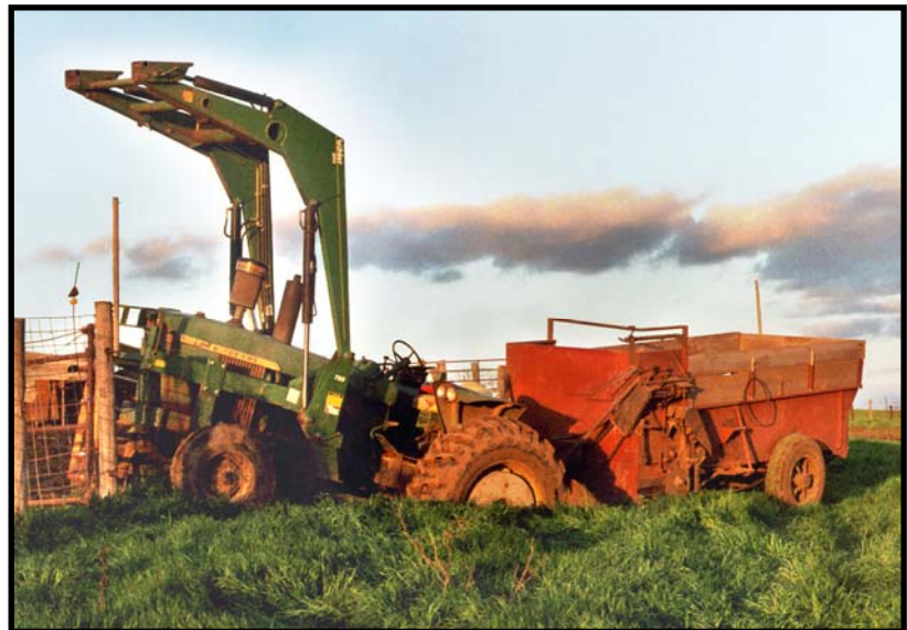
Photo 1 – Tractor and feed wagon where they were found (not where incident occurred) with loader still raised and tractor wheels dug deeply into the ground.

During the spring of 2005, a 45-year-old farmer was killed while feeding cattle on his farm. The man was driving a tractor equipped with a front-end loader that had a bucket attached to its lift arms. He was towing a single-axle feed cart behind the tractor and had finished filling several feeders in the cattle yard. On his way out of the cattle yard, he steered his tractor uphill on the incline back toward the gate. It was slippery due to recent rains. The tractor was losing traction. The victim moved from the operator station to stand on the hitch and raised the loader, presumably for added traction. Moving from the tractor seat to the drawbar of the moving tractor was something others had seen the man do before.