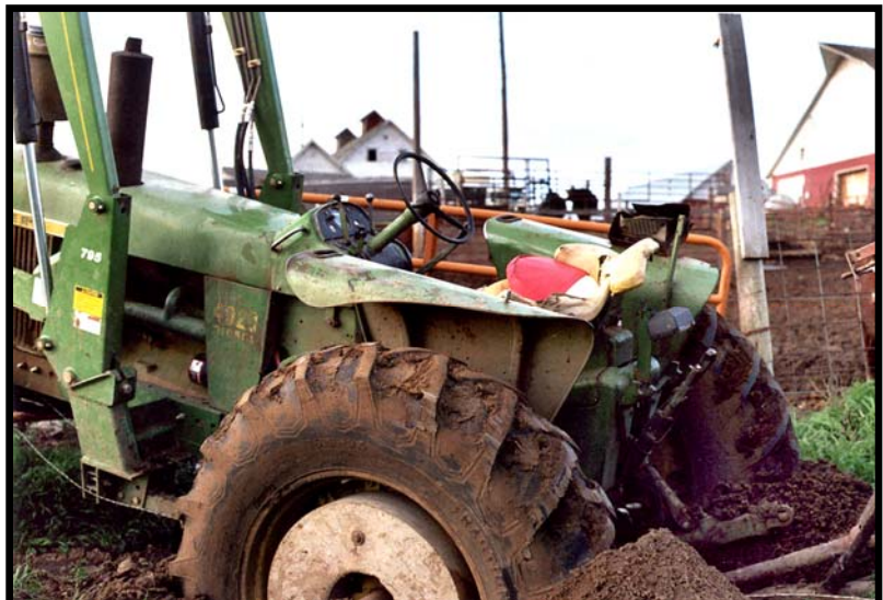
Photo 2 – Close-up of the tractor showing the rear wheels dug in, and also the smashed radio and damaged seat.

The farmer's wife arrived home from work after 5:00 PM and began to prepare supper. Hearing the tractor noise and seeing cattle loose on the farm, she assumed some animals had wandered off and that her husband was rounding them up.