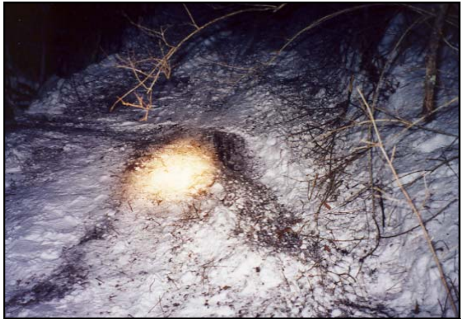
Photo 4 – Tracks of spinning rear wheels as tractor backed up grade of trail then slid to its right off edge of trail.

Discussion: ROPS are known to be extremely effective in reducing deaths in tractor overturns. Most agricultural tractors manufactured for North America after 1985 have ROPS, yet half the tractor fleet in current productive use in the US does not have rollover protection installed.