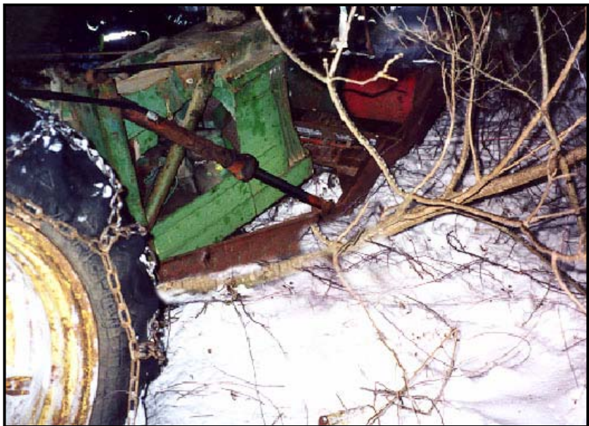
Photo 1 – Victim (not shown) was pinned against tree with loader frame across his abdomen.

A part-time scrap metal collector, age 50, was killed at the beginning of 2005 when the tractor he was operating overturned on the downward slope off the outer edge of an old path cut into the side of a bluff. He had been contacted to remove scrap metal from the back of a neighbor's property. The tractor had a tricycle-type front axle with a front-end loader mounted to its frame but did not have a rollover protective structure (ROPS). He salvaged an open, metal tank of the kind typically used for watering livestock, lifted it with the loader and steered the tractor back down the steep trail. The tank repeatedly came free from the loader. In the process of reloading the tank, then backing the tractor to reset his direction on the trail, the tractor's rear wheels spun in reverse gear and slipped off the trail's edge. The tractor-loader combination overturned, coming to rest on its top against a small tree. The tractor operator was